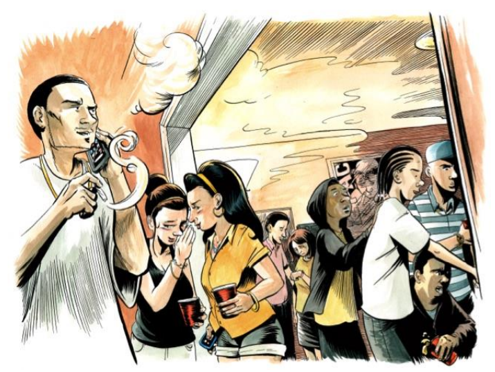
Figure 1: Storytelling Using Graphic Illustration

going on here?" The teens told stories that resonated closely with their own lives and involved topics such as unplanned pregnancy, sneaking out of the house, fighting, stealing, drinking, and drug use. The content produced by this activity helped to shape many of the storylines that were built into the videogame. Another activity we used to learn about teens' future aspirations was called My Life . For this project, we created a visual timeline that extended out ten years from the teens' current age and asked them to write down any important hopes and dreams they had for themselves. We learned about life goals such as going to college, having money, being successful, and being able to take care of their parents (such as helping them with their bills) in addition to getting a driver's license or the newest PlayStation or going to prom. This activity was essential to informing the development of the Aspirational Avatar (player's character that was the visual representation of their future hopes and dreams) in the game. Figure 2 is a screenshot from the videogame that provides an example of the creation of the player's Aspirational Avatar .