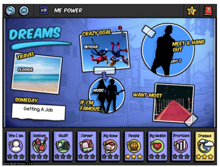
Figure 2: Creation of the Aspirational Avatar

Lesson 4: Look to the Literature. In the field of serious games research, this lesson is critically important: look to the literature; examine what has already been done and what worked or did not work. Consider what theories or frameworks were used to guide the development and/or evaluation of similar videogames (or interventions), what assessment data were collected and the methods to collect them. Systematic reviews can provide a thorough summary of current literature relevant to a specific research question [20]. For example, as part of the development of PlayForward , we conducted a systematic review on electronic media-based interventions that promote behavior