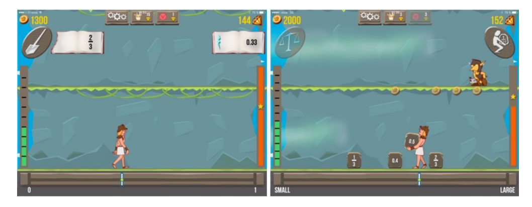
Figure 1. Left chart: An example of a number line estimation task in which the player should dig up a coin cache at the location reflecting \frac{2}{3} and avoid a trap at location \frac{1}{3} . Right chart: An example of an ordering task including both fractions and decimals; orange bar on the right side of the screen reflected the health bar that shows how much virtual energy is left