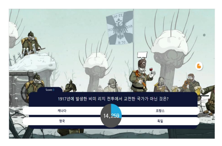
Figure 4. Twitch broadcast screen overlaid with quizzes from 'Quiz Kit'

The Twitch expansion program 'Quiz Kit' was used to induce learner participation during the broadcast and to smoothly proceed with feedback from instructors and learners. As shown in Figure 4, "Quiz Kit" is an extension program in which a quiz set by a streamer is overlaid on a broadcast screen, and viewers can solve the quiz by interacting with clicking the screen like a button. The quiz may be prepared in advance before the broadcast or may be modified during the broadcast.