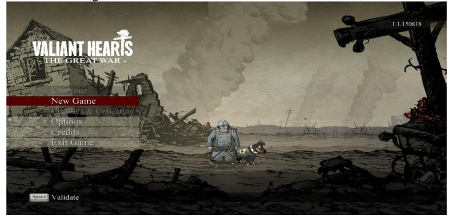
Figure 2. Game 'Valiant hearts : The great war' in-game screenshot

As a game that satisfies the above conditions, 'Variant hearts: The great war' was selected as the learning material.