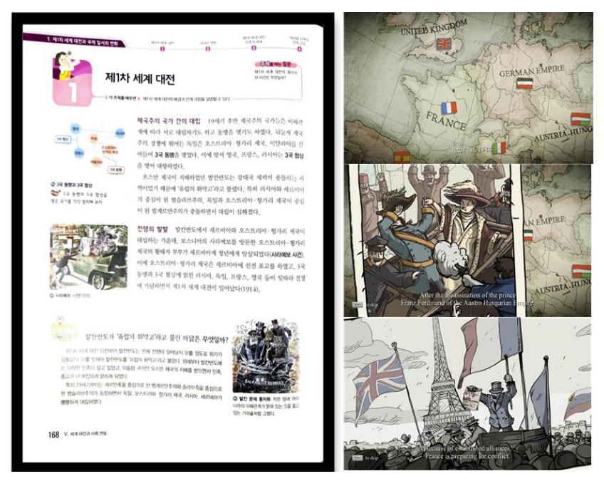
Figure 3. Comparison of game prologue and textbook content

The contents of regular classes related to World War I can be found in Chapter 5, 'World War II and Social Changes' in textbooks for second graders in middle school. The prologue of the game begins by showing the beginning of World War I like a cartoon, and the textbook explains the contents as shown in Figure 3 on the first page of the learning unit.