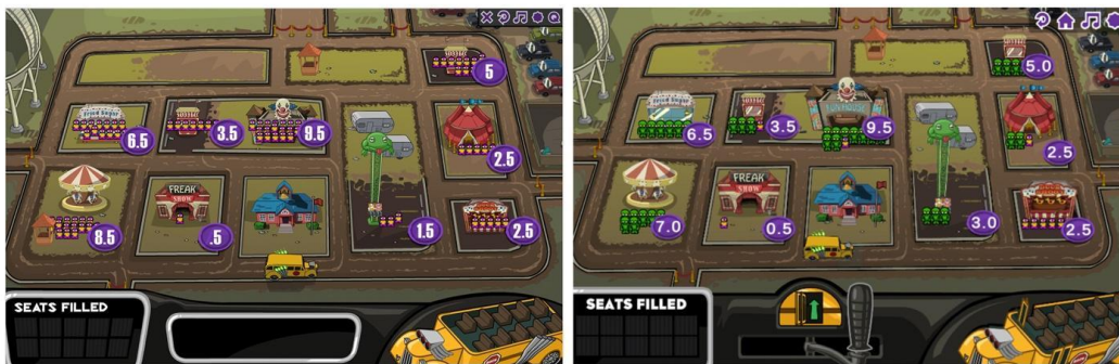
Figure 7. (left) Previous game number presentation; (right) Revised game number representation.

Recommendation: Make the representation consistent. The team standardized number representation in all levels. The decimal number representation used in some levels was difficult for players to understand, mainly for players with learning disabilities. To solve that, the team added “ones” or “tenths” to make the representation consistent (Figure 7 – right). For instance, the way decimals were written was changed from “.6” to “0.6” and “.2” to “0.2”, depending on the level. In levels that have numbers that go to hundredths, the game now uses “0.20” instead of just “.2” to keep the consistency.