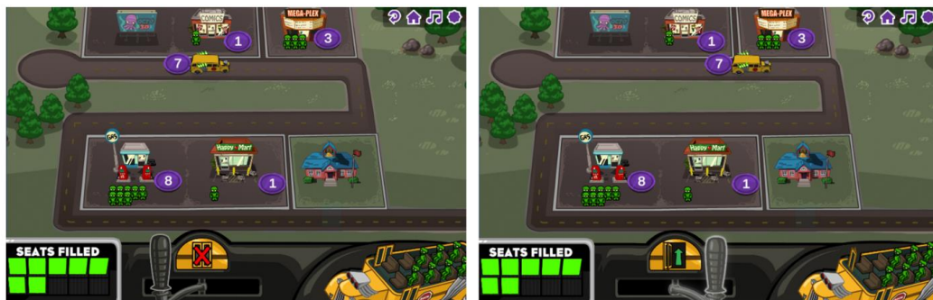
Figure 5. (Left) System showing players the closed bus door; (Right) System showing players the open bus door, explaining how monsters get on and off a bus.

Some users may struggle to understand icons, so it is important to make visual elements easy to follow for users with cognitive needs who have difficulty processing information. For example, as the player selected monsters to ride on the bus, monsters could move on and off the bus without a door opening or closing. That doesn't make sense to a literally minded player who expects to see a door opening. Some players with cognitive disabilities need literal reinforcement. They know that without an actual door opening, monster kids would not be able to exit the bus. As a solution, the team changed how the bus was represented, showing the bus door open and close. Players can open and close the door using a visual handle on the interface (Figure 5). This simple accessibility action improved gameplay by giving all users the ability to intentionally choose which kids to pick up and which to drive past, to pick up on a later trip. Previously, players would automatically pick up whatever monster kids they drove past, which did not encourage them to be mindful in using the 10-frame guide to fill a bus. This change improves the gameplay and allows players to have better functionality when picking up and delivering the kids as part of their intentional math decisions.