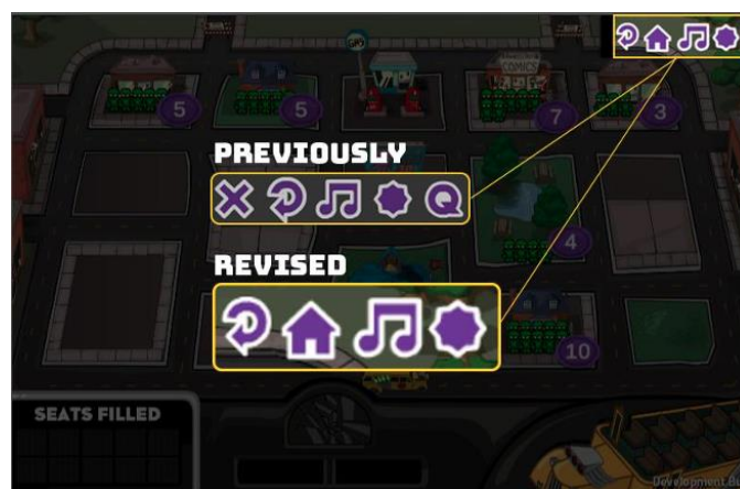
Figure 2. Previous and revised version of the game’s Heads-Up Display buttons. The button “Q” used to choose the game image quality (in Flash) was removed. This function is not necessary for the Unity version.

Recommendation: Use good letter spacing and prioritize readability when choosing the font. Use a clear, direct, and simple font. The team identified the game typography in menus and narrative dialogues as an accessibility limitation for visuals in the game. The ‘grunge-style’ of typography used in the menus omits some parts of individual letters, and uses a tight spacing of letters (Figure 3 – left). These typography issues could