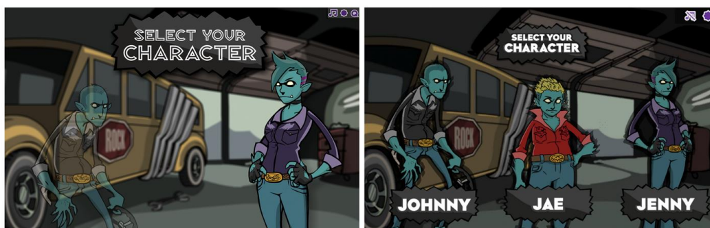
Figure 10. (left) Previous game character select screen; (right) Revised game character select screen.

Recommendation: Provide solid contrast between backgrounds and game elements the player will use to interact, such as menus and characters. The team identified some contrast issues in the game character select screen. They also identified a lack of character diversity. The lack of contrast between the character and the background made it difficult for players with low vision or contrast to properly navigate the screen (Figure 10 – left). As a solution, the team removed the transparency and added a black outline around the character. When players select the character, it increases its size and gets brighter (Figure 10 – right). The team tested all the game graphic elements for color blindness and contrast ratio.