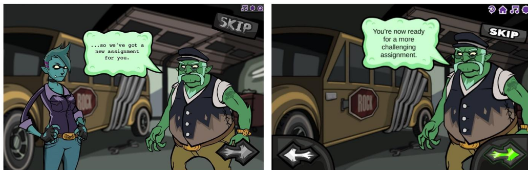
Figure 4. (Left) Previous version of the game narrative text; (Right) Revised version of the game narrative text, with a backward arrow added, clearer font, and more specific and positively motivating language.

Recommendation: Use direct and encouraging language. Avoid ambiguity, abstract words, and harsh language. In trying to offer humor through the narrative of a grumpy school bus driver, the game instructions and narrative lacked clarity about players' actions. It also offered language that was too harsh. The team rewrote the game narrative to make it more explicit regarding game actions that players need to take. The team added a back arrow, giving players full control over the narrative presentation (Figure 4 – right). They also reviewed text for unintentionally harsh language, replacing it with more positive phrasing, and avoiding ambiguous words. These changes may benefit all players, but certainly improve processing of the game by those with cognitive disability.