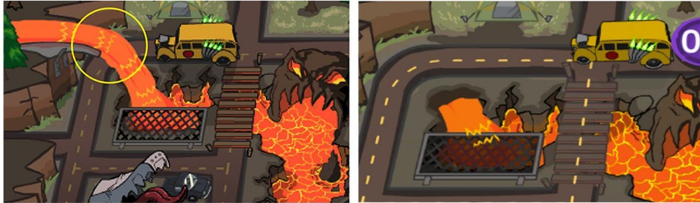
Figure 11. (left) Previous gameplay screen with parts of the road blocked; (right) Revised gameplay screen without blockages at the road.

Recommendation: Make all paths visual, literal, and easy to follow. The team revised the game paths to avoid visual blockage that could confuse learners with cognitive disabilities, who need literal paths. In the game levels, parts of the road moved “behind” lava pools or waterfalls (Figure 11 – left). This limitation could confuse players visually and cognitively about the bus driving path, as they would see the lava as a visual block on the road. The team redesigned the roads, keeping the same style and removing graphic elements (lava/water) that go over the road (Figure 11 – right). They also made the road consistent in each level, so that even when the bus travels over a bridge, it is clear where the path is.