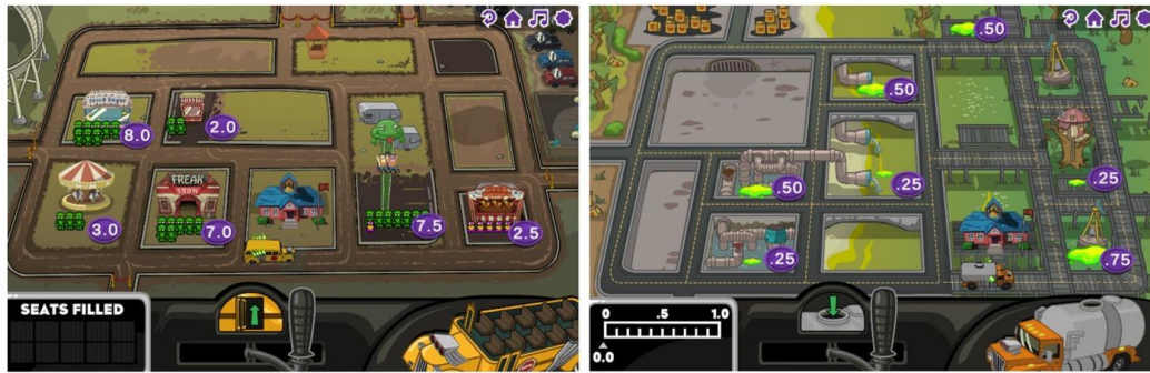
Figure 6. (left) Level preparing players to play using decimals; (right) Level preparing players to play with the whole unit equal to 1.0.

cognitively for all players, especially for players with learning disabilities who need more time practicing to master an activity.