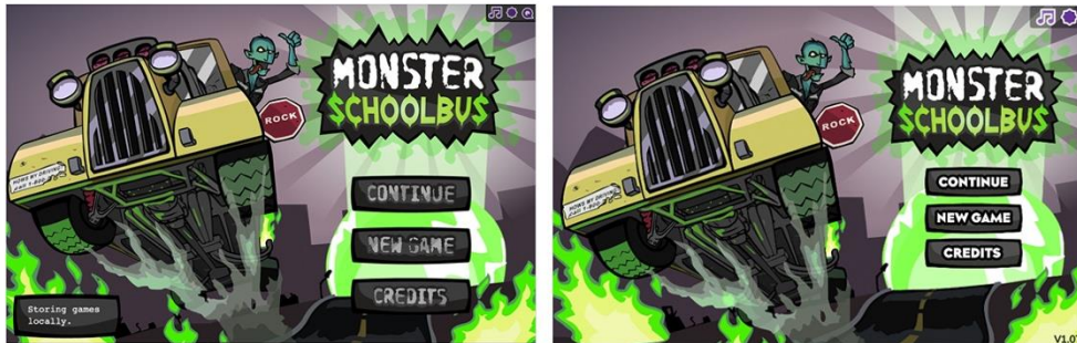
Figure 3. (Left) Previous version of the game title screen; (Right) Revised version of the game title screen.

make it hard for players with low vision or dyslexia. The team replaced all the game fonts, choosing clear and simple fonts, providing good letter spacing and readability (Figure 3 – right). The team also shortened the lines of narrative dialogue and increased the contrast between the text and the background in the menus, making it easier to read [23]. The original typography was retained in the title of the game to support the visual narrative, but it was changed in text that provided essential information for navigation. This supports players' visualization and processing needs for the game's text-based information.