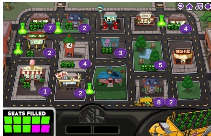
Figure 8. The green flasks on screen.