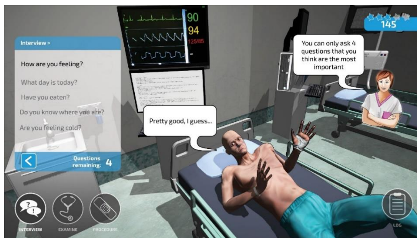
Figure 2. Screenshot from the simulation game

The prototype of the CareMe simulation game used in this study is a single-player game developed at the University of Applied Sciences in Helsinki (Figure 2). The game was designed in collaboration with researchers, nurse educators, students, programmers, a 3D artist and an interface designer through iterative cycles of designing, testing, and refining the prototype [see 63-64]. In table 1, the learning and game mechanics of CareMe simulation game are presented by applying Arnab et al's [14] Learning Mechanics-Game Mechanics map. The Unity development platform was used to create the game. The game consists of patient scenarios, which are events designed around a specific clinical situation requiring clinical reasoning. The game mechanics are built around the clinical reasoning process. In the game, the player takes the role of nurse. The game view includes a 3D character (the patient) in a 3D environment representing hospital ward, with authentic reactions and equipment. The game is immersive in that it focuses on genuine patient concerns and the willingness of the player to help the patient. The system provides for immediate, sustained, and cumulative feedback in the form of reasoning, points, patient reactions, in-game facilitator's comments, and success and failure effects. The game also has a fast-paced complication mode, in which players compete against time and must make quick decisions.