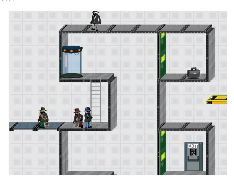
Figure 3. A screenshot of the TeamBoost game (zoomed in); one player has built a bridge to help another player to overstep the gap.

TeamBoost has a stronger story theme compared to Labyrinth Run as players control a group of secret agents in a laboratory, mansion or factory settings (Fig. 3.). In order to better match the challenge of the level to the skills of the players, the levels are freely selectable and they have a difficulty rating (0-3 stars). Difficulty ranges from a tutorial level, where some basic tasks are performed with onscreen instructions, to really challenging levels, which require some serious thinking and problem solving even for experienced players. A couple of new winning conditions were also added.