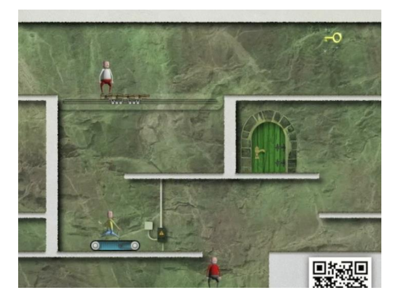
Figure 1. Screenshot of the Labyrinth Run game (zoomed in); one player runs on a treadmill to help another player overstep the gap with the moving platform.

According to Pasch et al. [38], natural control and mimicry of movements influence immersion in movement-based interaction. Thus we tried to implement natural gestures for game controls and display player's movements in the game screen. In practice, a player has a mobile phone in his hand or in the pocket that interprets the light movement into walking and sudden movement into a jump (Fig. 2). When a player walks in place, the game character walks forward on the screen and when the player jumps, the game character will also jump. We did not manage to implement turning of a game character with decent physical movement and thus we had to use substitutive method as follows. When the game character hits an obstacle, it changes the direction of walking.