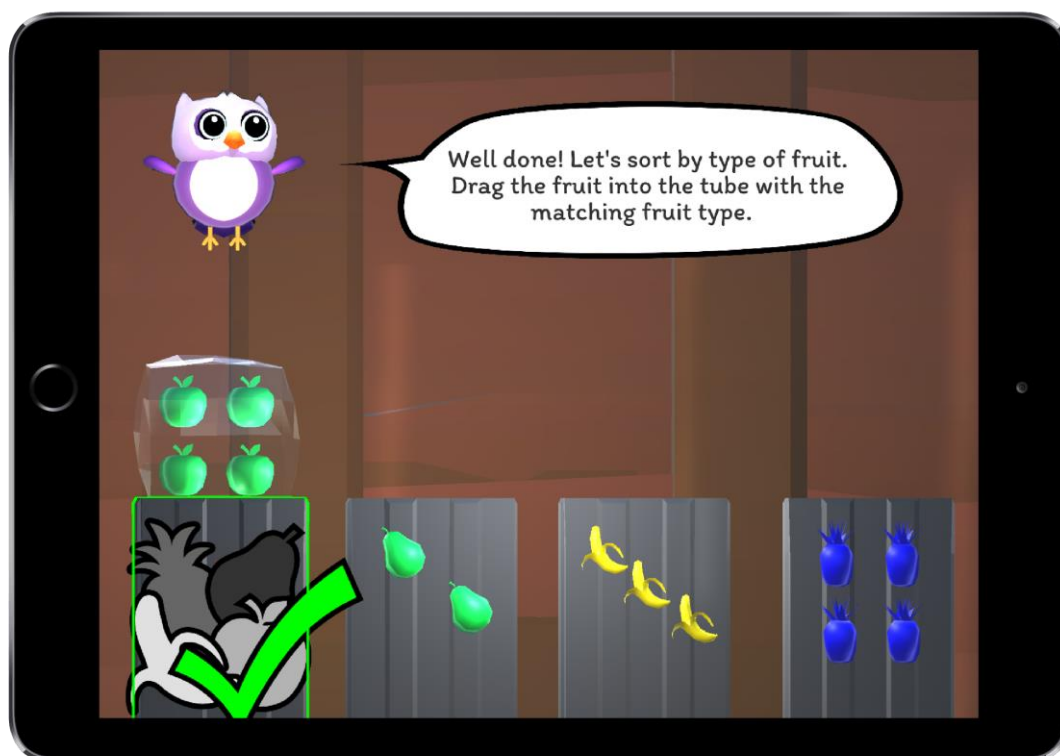
Figure 3. eFun Ice Cube Sorting game measuring cognitive flexibility showing the practice phase. The ice cube needs to be sorted into one of the tubes. If the correct rule was ‘color’, the cube would need to be sorted into the second tube, for the rule ‘shape’ it needs to be sorted into the very left tube (as shown) and for the rule ‘number’ it would need to be sorted into the very right tube.

In Version 2, Owly and the speech bubble disappear after instructions/feedback are given, rather than staying on screen (as in Version 1). They only come back for inactivity reminders if the student does not respond. This eliminates distractors and is supposed to help the student focus on the task itself. Additionally, terminologies were adjusted to suit the student’s developmental level. For example, the term rule was changed to how we sort : ‘The rule has changed’ was replaced with ‘we’ve changed how we sort the fruit’. These and other script changes make it easier for the student to understand the game. Lastly, a demonstration phase with a visual hand was added to show the student how to drag the ice cubes into the tubes.