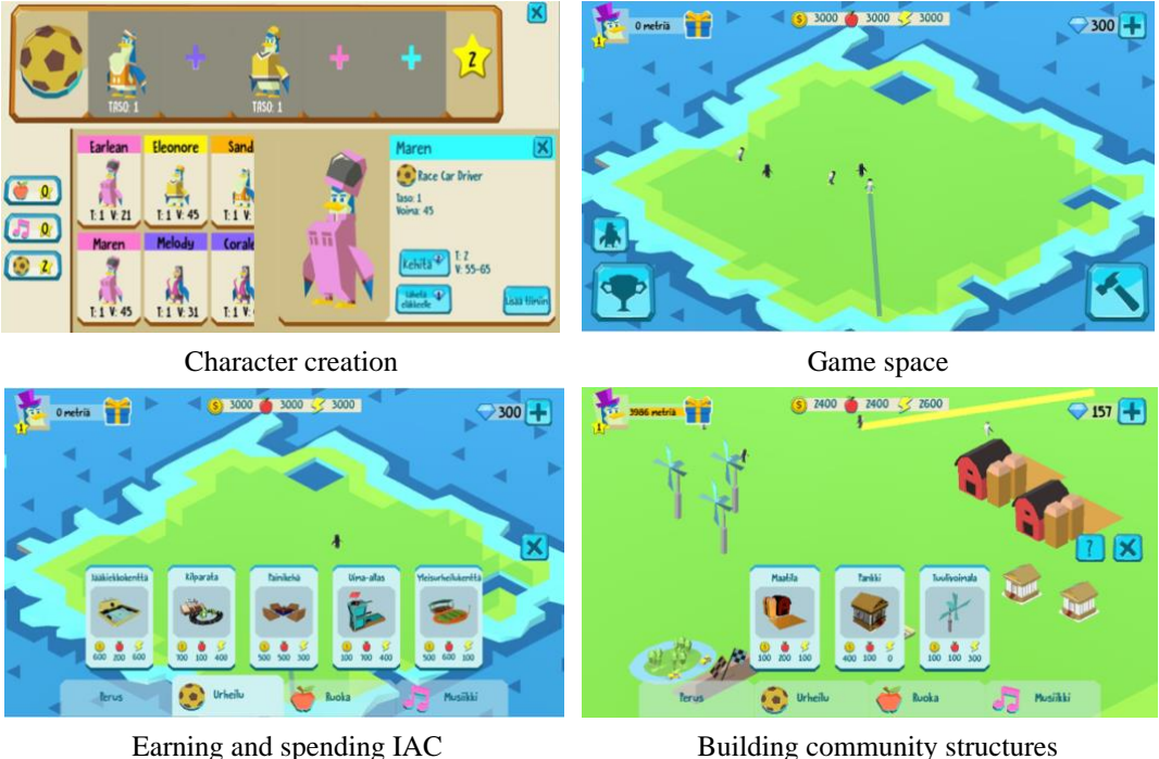
Figure 1 . Visual display screenshots of the exergame

The PA levels are measured through various sensors available on the mobile device. The health objective of the game is to increase the player's PA levels by rewarding success progressions in the exergame. The exergame provides vicarious experiences, positive feedback, and fun for players, which are all important sources for self-efficacy [47]. Figure 1 shows four excerpts of the exergame's visual display (character creation, game space, earning and spending IAC and building community structures).